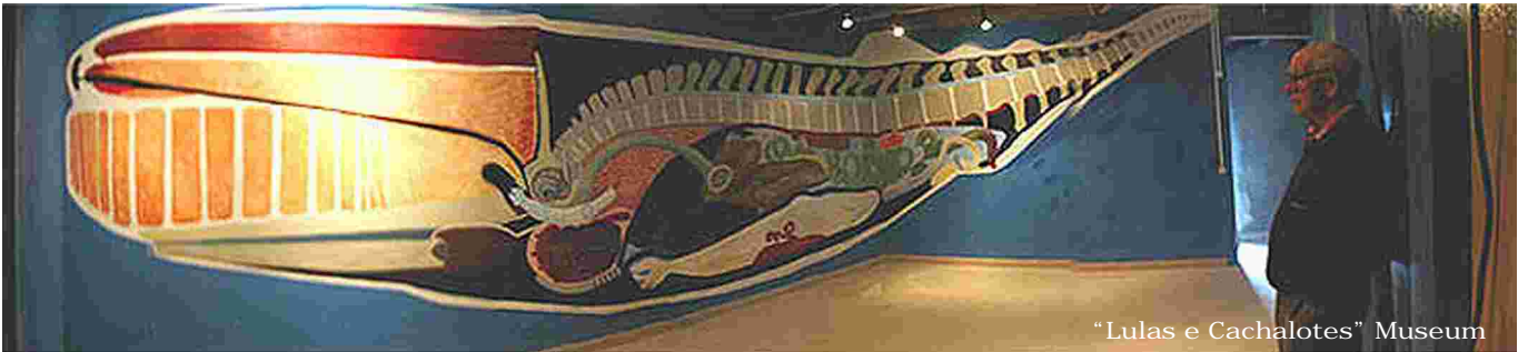
“Lulas e Cachalotes” Museum

In Piedade (situated in the eastern coast) you can discover a different Pico ... on horseback. The local cheese and the wine are just part of the picnic at Nélia's "adega" (typical basaltic house).